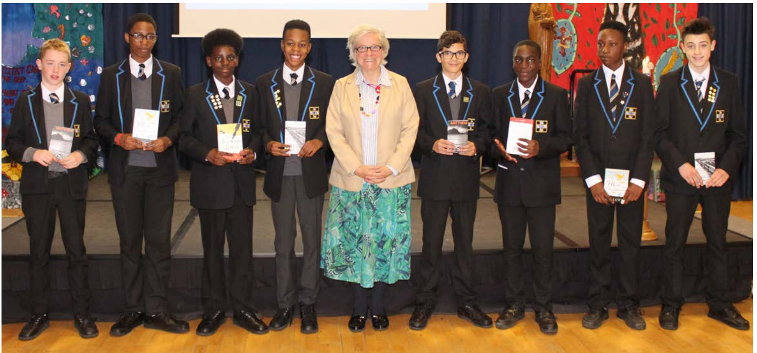
The winners of the Schools Bible Project 2017