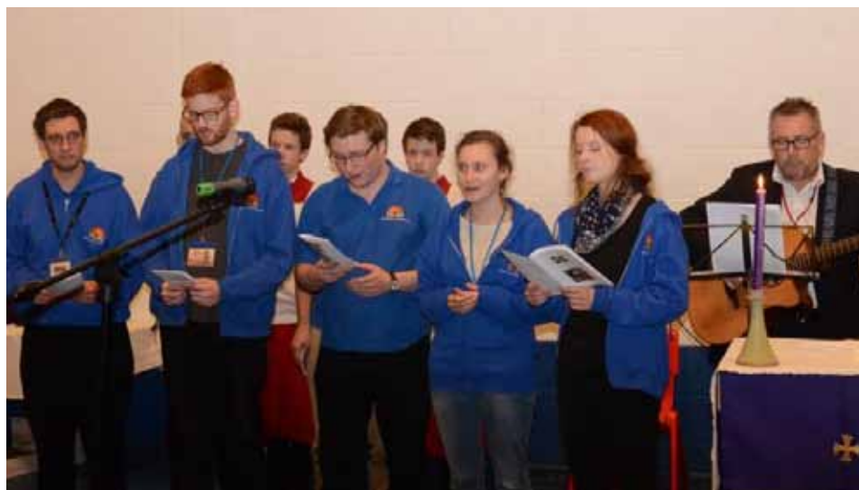
The CRiBS group singing to the congregation