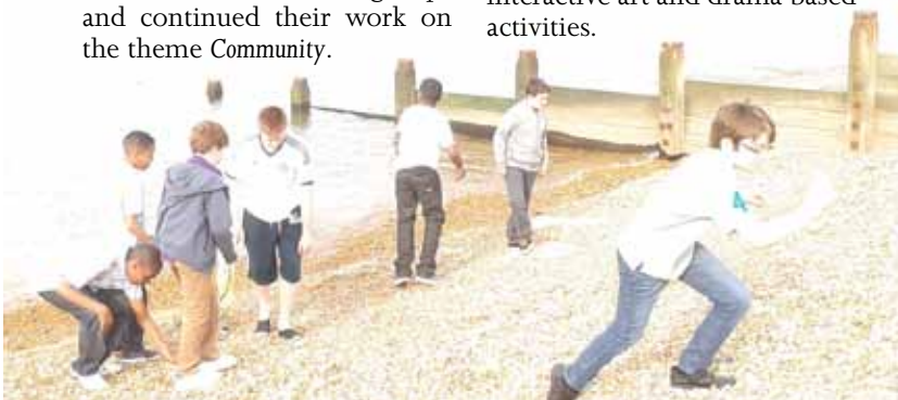
First lesson of the day - playing on the beach

Friday was our last day. The boys had to change the bed sheets. They all made a good attempt. Without being asked, the boys then vacuumed and also cleaned the toilets. The Cleaner said that it was the first time that she had nothing to do. We started our morning lessons in small groups and met up for chapel before lunch and then returning to school. It was a great three days full of interactive art and drama based activities.